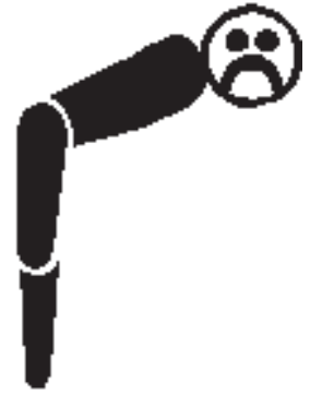
Proper position for falling when you ski downhill.

For balance & shock absorption: the upper body is slightly slumped, but still upright.